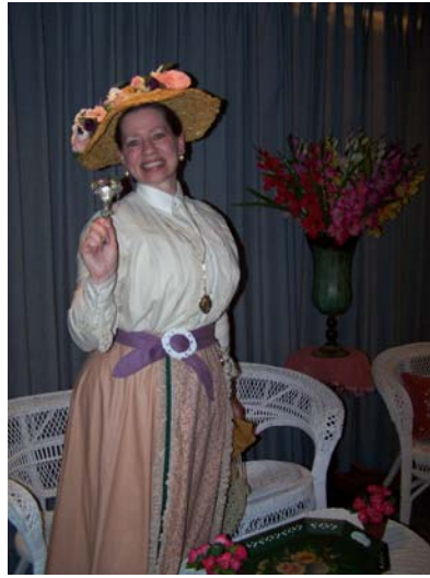
Proper Victorian Lady ready for social event with her nosegay.