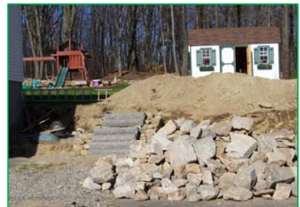
Stairs and field stone delivered

The first phase started with the embankment being dug up by Earthworks. The Caledonian granite stairs were delivered by Camosse (Worcester). Each stair was rolled off the delivery truck and leveled exactly into place. Stay tuned for updates on progress. I would really appreciate your ideas on planting and landscaping the area. mrannikko@yahoo.com